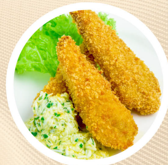
The colour of the Fish Fillets are lighter, after using Coco Empire Coconut Cooking Oil