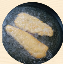
High Temperature Deep Frying Fish Fillet